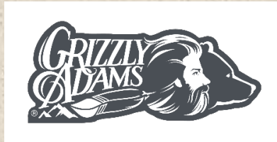
Grizzly Adams, LLC

Vital Ground's Business Partners in Conservation program provides numerous ways for businesses of all sizes and types to support conservation in the Northern Rockies, from product royalty agreements to employee matching gift programs. Our partners' investments protect the landscapes most important to grizzly bears, other wildlife and people alike, all while promoting their products, services and brand to our conservation-minded audience of more than 60,000 supporters.