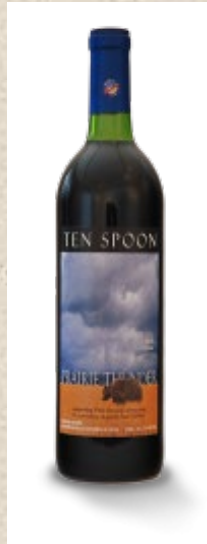
Ten Spoon Vineyard + Winery